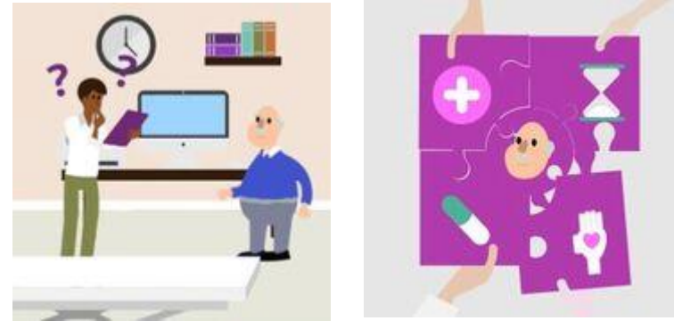
Figure 1 - Some animations.