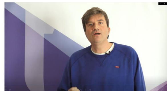
Figure 1 - Screenshots from the final videos.