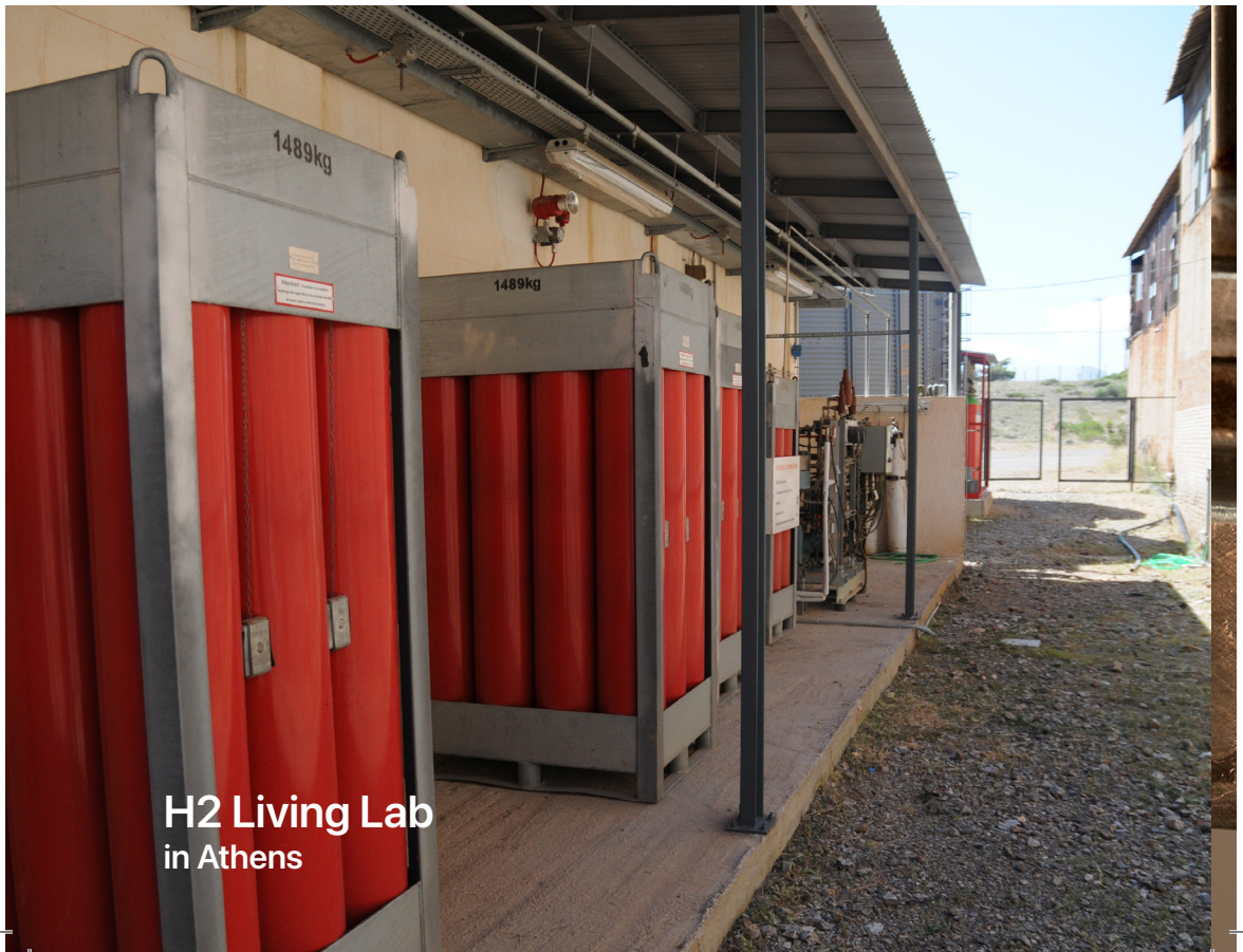
H2 Living Lab in Athens

Focusing on the calcination process, the NTUA pilot will demonstrate the IFRK prototypes for the Lime and Magnesite Production use cases.